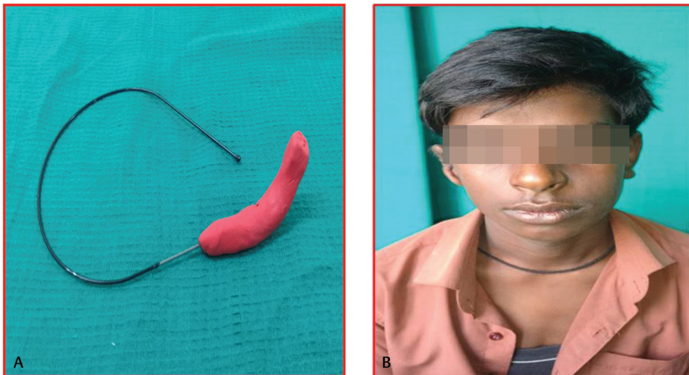
Fig. 1 (a) Splint with thin wire band framework. (b) Splint with thin wire band application.