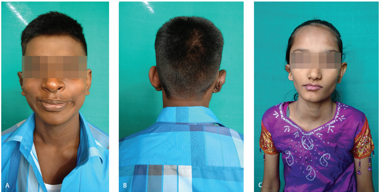
Fig. 5 (a–c) Postsplint application ear projection.