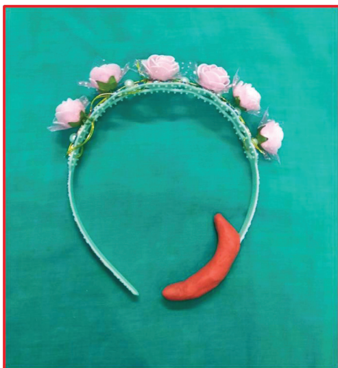
Fig. 3 Splint with fancy hair band framework.