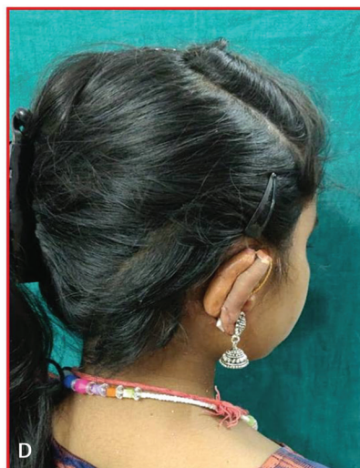
Fig. 4 (a-d) Splint with mattal earring framework application.