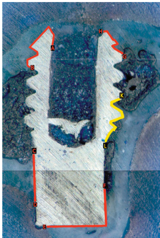
Fig. 1 Scheme of cortical and trabecular bone measures

During the experimental period, the animals were weighted at the day of the sacrifice. The mean weight of the control group was 395.33 g ( \pm 32.73 ), while in the experimental group the mean weight was 403.38 g ( \pm 31.56 ). No statistically significant difference was found between the groups.