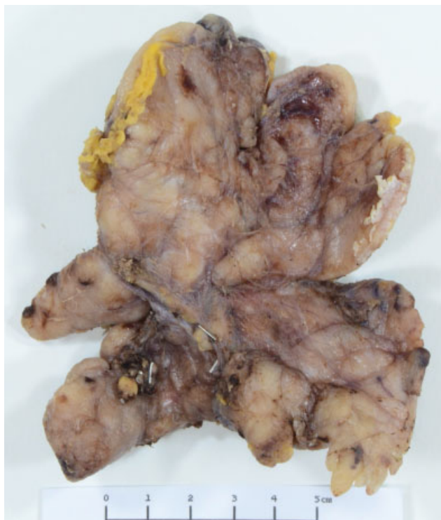
Fig. 2 Thymectomy specimen showing a measuring 124 × 110 × 25 mm lobulated cream surface without a discrete mass.

Anterior mediastinal masses are encountered uncommonly in routine clinical practice. They incite a broad but relatively