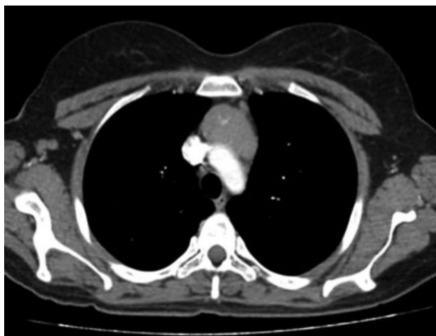
Fig. 1 Axial section of thoracic computed tomography showing anterior mediastinal mass.

and with no discrete mass. Following extensive sampling, histopathological examination revealed expanded thymic tissue consistent with “true” thymic hyperplasia (►Fig. 3A) with a minor component of “lymphoid” hyperplasia (►Fig. 3B). A clinicopathological diagnosis of thymic hyperplasia secondary to previously undiagnosed Graves' disease was therefore rendered.