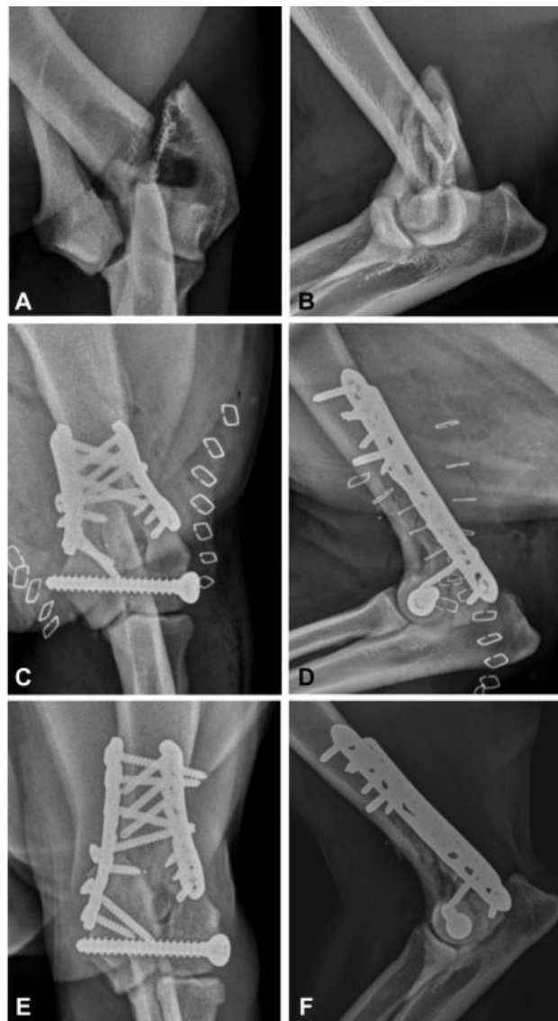
Fig. 1 Case 4 (Labrador Retriever) preoperative caudocranial (A) and mediolateral projections (B) showing simple condylar humeral fracture with a short lateral and long medial component. Immediate postoperative caudocranial (C) and mediolateral (D) views showing a medial 2.7-mm and lateral 2.4-mm locking compression plate, using hybrid fixation with a 4.5 mm transcondylar positional cortical screw. A small intra-articular gap persists consistent with humeral intracondylar fissure pathology and the articular step defect is 0.7 mm. (E) Caudocranial and (F) mediolateral views at the 8-week postoperative stage showing ongoing intracondylar gap, with remodelling supracondylar fracture lines.

Short-term outcome was considered fully functional in 9/13 patients. This included case 8, which has a grade 7/10 lameness on the repaired limb at 2.5 weeks postoperatively with septic