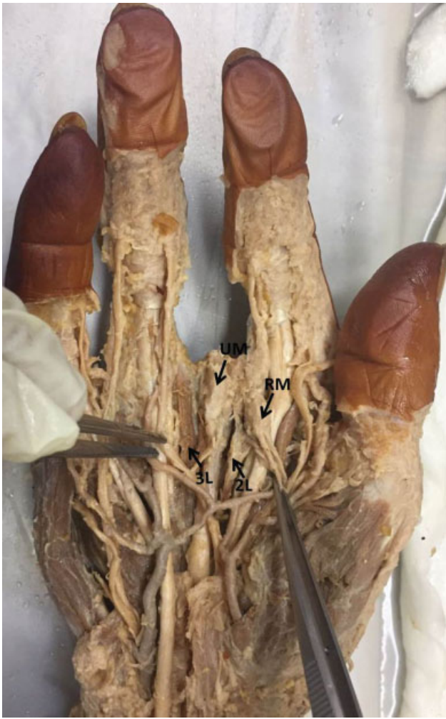
Fig. 3 Dissection of the right hand showing the distal attachment of the 2 nd lumbrical (2L) and of the 3 rd lumbrical (3L). Note the position of the 2 fibrotic masses: ulnar mass (UM) and radial mass (RM) at the base of the palmar cleft.

central digits are involved. 2 The remains of the missing finger will still possess some active movement. The present case may fall under the atypical category due to it being unilateral and having a U-shaped cleft. However, in the present case, contrary to the classical atypical cleft hand, the thumb, the ring and little fingers are of normal size.