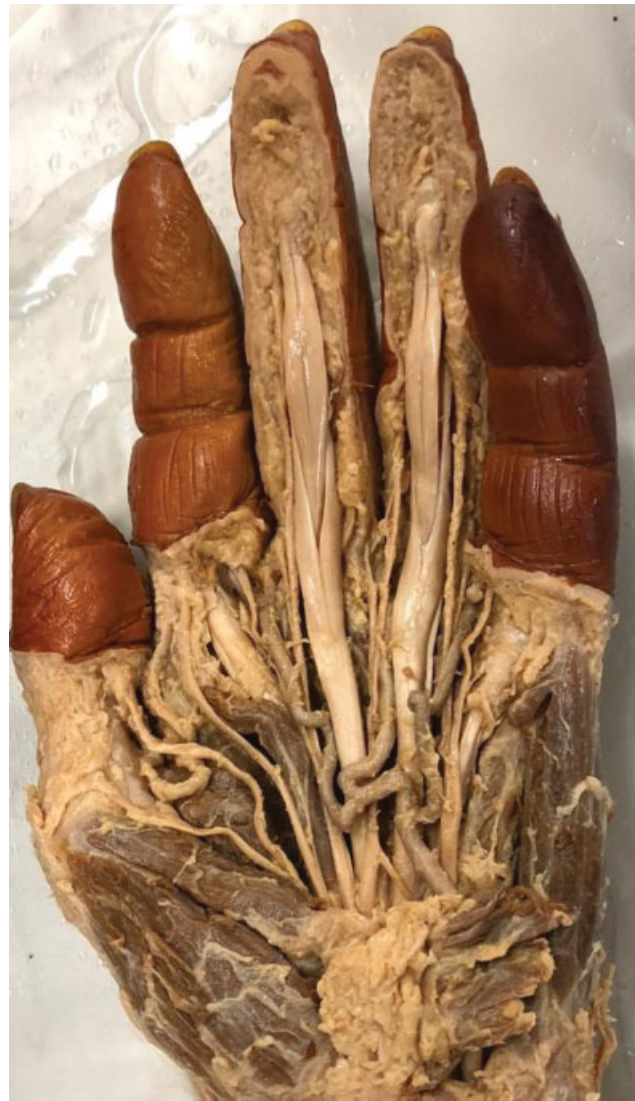
Fig. 4 Dissection of the left hand showing the presence of all digits.

In cleft hand deformity, the bone abnormalities are more frequent than those of soft tissues. They include fusion of adjacent metacarpals, bony bridges across the digits, and proximal phalanx having articulation with two metacarpals. Carpal bones may also show abnormalities. 7 In our case, the three phalanges of the middle finger were absent. There were no other bony abnormalities. Generally, the flexor and extensor tendons of the missing fingers fuse with each other to form tendinous loops over the rudimental carpal or metacarpal bones. The altered bony configuration may lead to extrinsic and intrinsic muscle abnormalities. 7 In our case, the flexor and extensor digital tendons are inserted over the head of the metacarpal bone of the missing middle finger. The 2 nd and 3 rd lumbricals showed variations in their distal attachment.