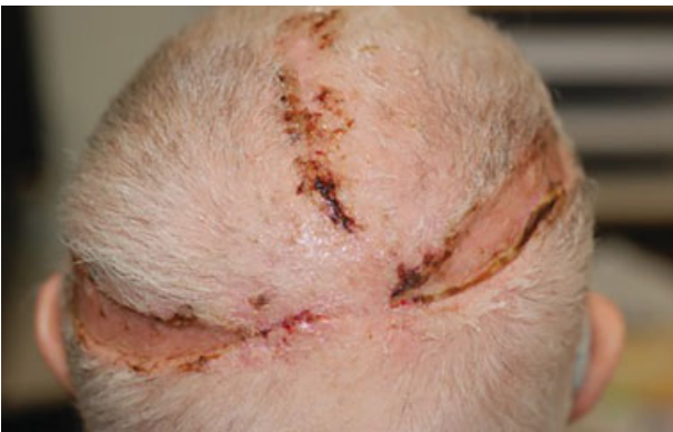
Fig. 7 Postoperative image.

The patient had an unremarkable postoperative course. There was no evidence of wound infection, flap necrosis, or skin graft failure (► Fig. 7 ). The patient has no evidence of tumor recurrence during a follow-up period of 6 years and has required no revision surgeries (► Fig. 8 ).