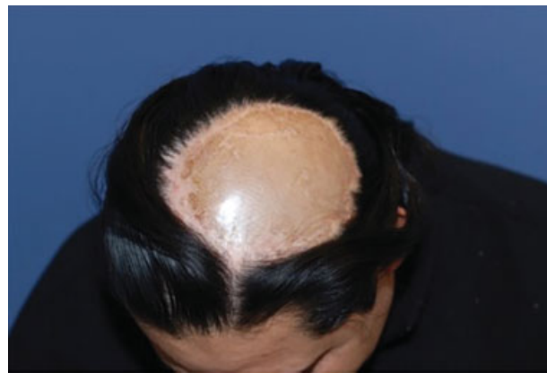
Fig. 5 The end result of case 9.

The serratus muscle free flap with its inferior four slips was harvested for soft tissue reconstruction. The superficial temporal artery and vein were identified as the recipient vessels. A STSG was harvested from the left lateral thigh for free flap coverage. One Jackson–Pratt drain and one Penrose drain were placed at the time of scalp closure. Xeroform was used for wound coverage and the patient was transferred to