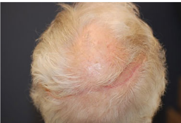
Fig. 8 The end result of case 3.

In this case series, we present our novel algorithm for en bloc resection and three-layered reconstruction (dura, cranium, and scalp skin) of solitary calvarial tumors using an interdisciplinary approach.