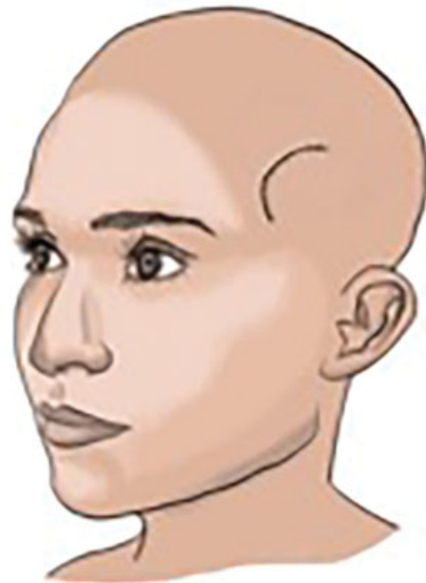
Fig. 1 Scalp defect less than 3 cm in maximum width.

The third layer includes soft tissue reconstruction of the scalp. Primary closure is indicated and feasible if the scalp defect over one hemiconvexity measures less than 3 cm in maximum width (→ Fig. 1). Soft tissue defects measuring between 3 and 6 cm in width can be managed by a local scalp flap (e.g., rotational flap, V-Y advancement flaps, Orticochea