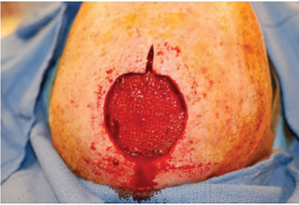
Fig. 6 Intraoperative defect of case 3 displaying the titanium mesh.