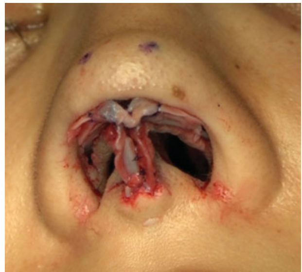
Fig. 11 Double dome graft.

The next maneuver is lateral dissection between upper lateral cartilage and nasal bones (► Fig. 10 ). As the nasal dorsal hump is not a two-dimensional structure apart from the release at the dorsal keystone area we should also mobilize the lateral keystone area to change the shape of the nasal dorsal anatomy. With this maneuver, as the side wall connections will be mobilized and there is no areas to resist the newly shaped nasal dorsum, hump recurrence problem will also be eliminated.