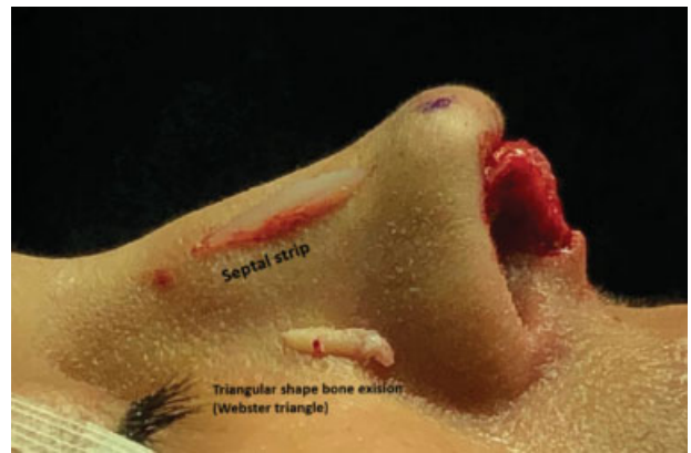
Fig. 5 Excised septal strip and triangular shape bone excision in the piriform aperture (Webster triangle).

For connecting both sides of transverse osteotomies additional incision was performed externally using the 2 mm osteotome (→ Fig. 8).