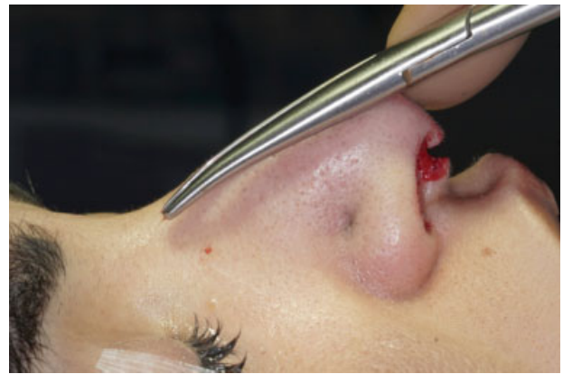
Fig. 4 Bony septum was excised by using 2 mm Baby Rongeur.