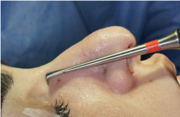
Fig. 7 The Tastan-Cakir saw.