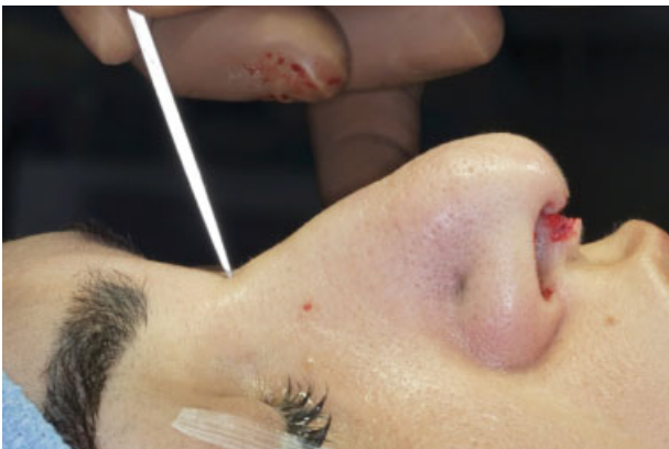
Fig. 8 External incision with 2 mm osteotome.