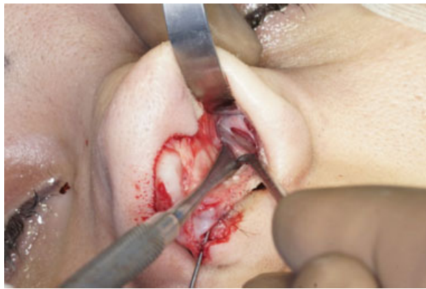
Fig. 2 Subperiosteal tunnel for lateral and transverse osteotomies.