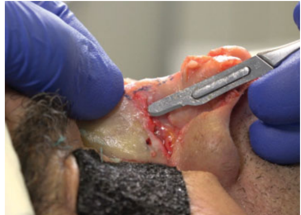
Fig. 10 Lateral dissection: undermining upper lateral cartilage from the nasal bone in the key-stone area (demonstrated on cadaver).