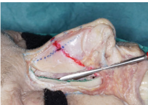
Fig. 9 Periosteum elevation of the inner surface of the maxillary bone (demonstrated on cadaver).