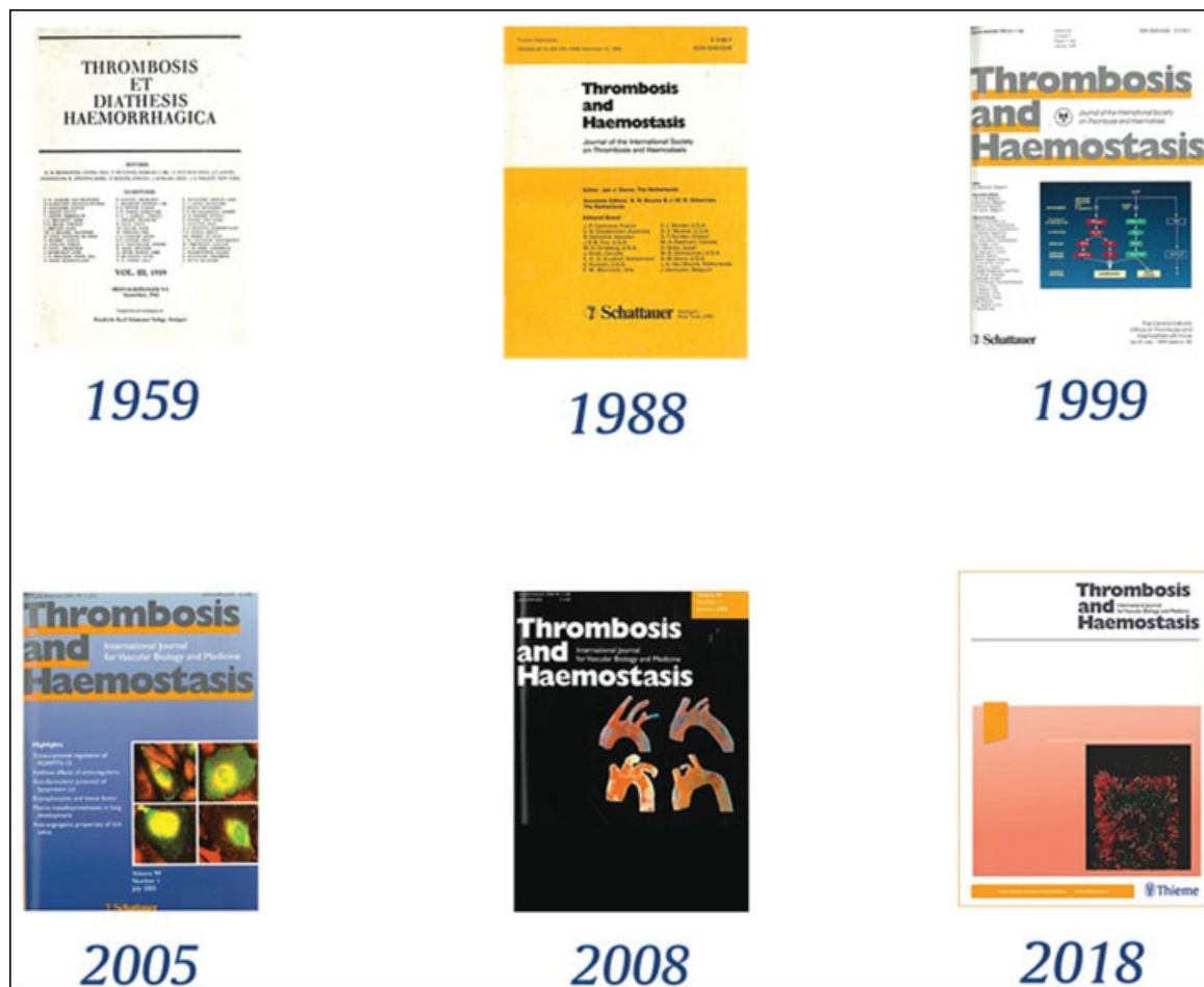
How the cover design has evolved over the years.

latest publications on the T&H website, but you are now also able to browse through all issues dating back to 1957, representing your past 61 years of hard work and findings!