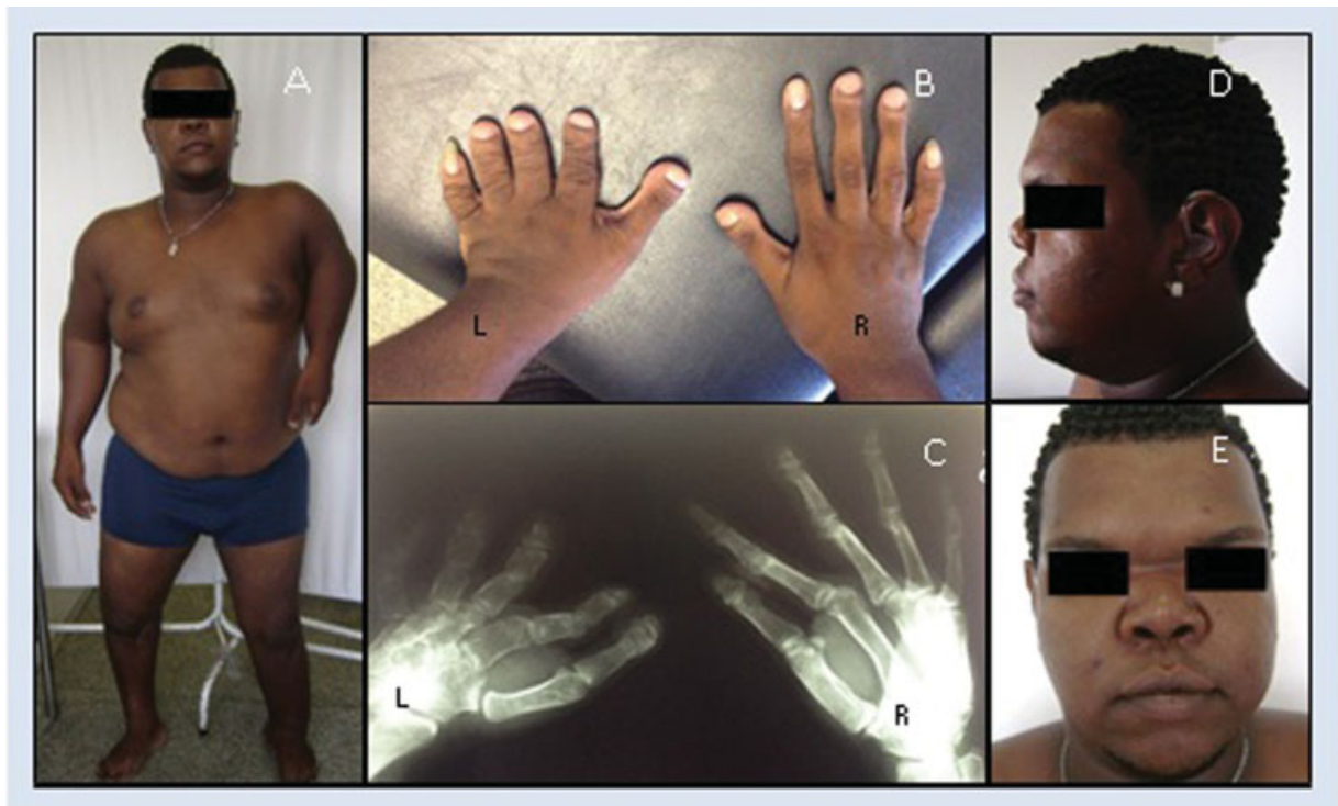
Fig. 1 (A): The father showing disproportionate short stature with short and asymmetrical legs, shortened upper left limb with restricted elbow extension; genu varum on the right. (B, C) Asymmetry of the hands, left hand with brachydactyly, wide distal phalanges, spatulate fingers. (D, E) Macrocephaly, ocular hypertelorism, low nasal root, short nasal dorsum, anteverted nostrils, prominent supraorbital ridges. Note: images provided and authorized by parents with informed consent.