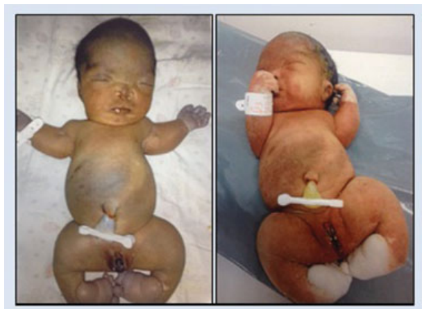
Fig. 2 Stillborn with short stature, short and curved femurs, club feet, macrocephaly, broad forehead, hypertelorism, nasal hypoplasia, micrognathia, short neck, humerus agenesis, thoracic narrowing, short and spatulate fingers. Note: images provided and authorized by parents with informed consent.

In filtering, we have considered only rare mutations with a minor allele frequency (MAF; < 0.5%) in all populations of the public databases analyzed and in our in-house control database. Only variants with > 20 read depths, average quality score > 30, allelic balance > 0.90 for the alternative allele and < 0.10 for the reference allele for variants in homozygous, and allelic balance between 0.2 and 0.8 for variants in heterozygous, and with strand bias < 2 were considered. All loss-of-function variants (LoFs; (mutations