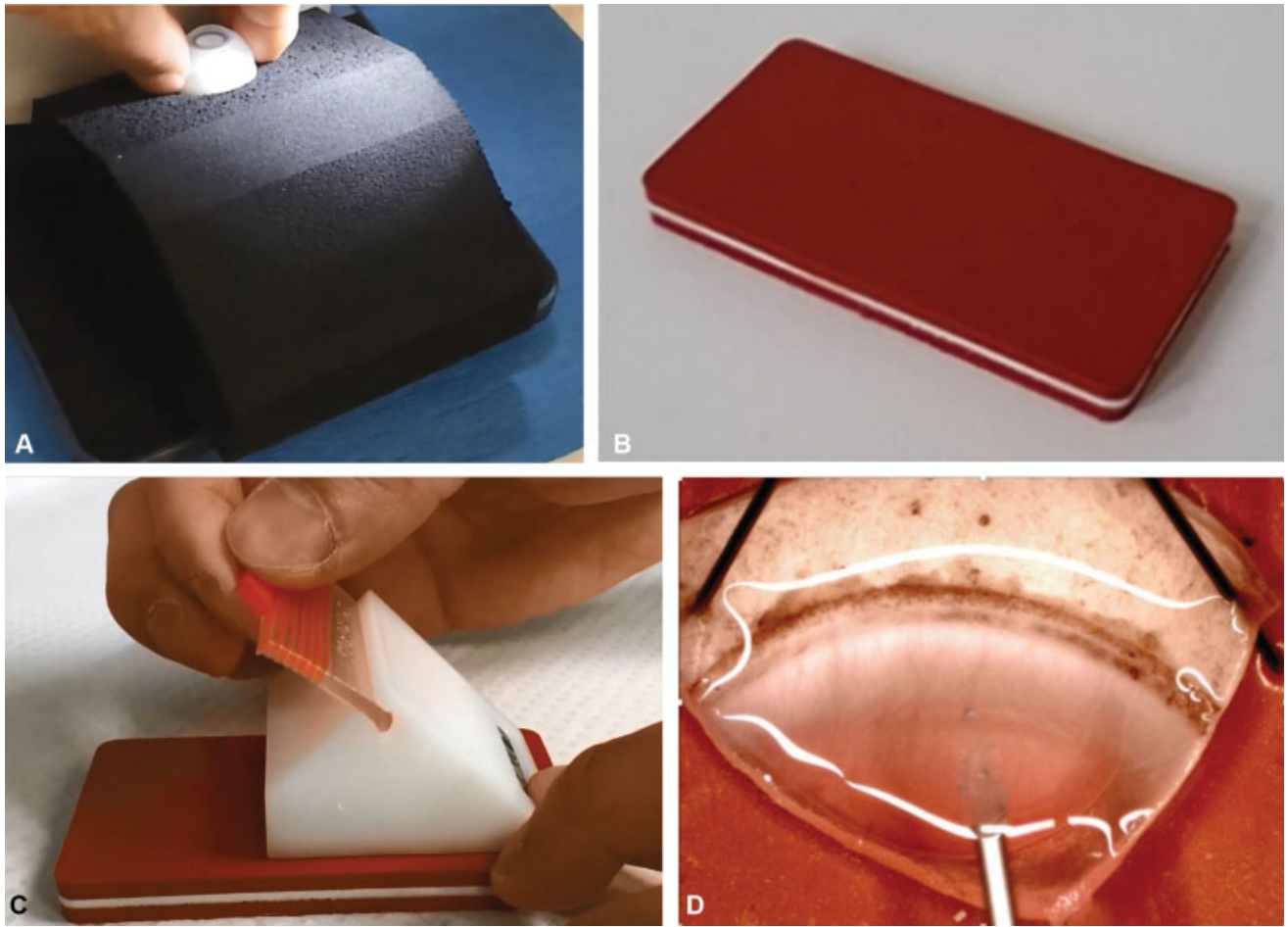
Fig. 1 (A) Eye model for practicing gonioscopy. (B) Synthetic pad mimicking texture of trabecular meshwork. (C) Artificial trabecular meshwork. (D) Human cadaveric tissue.