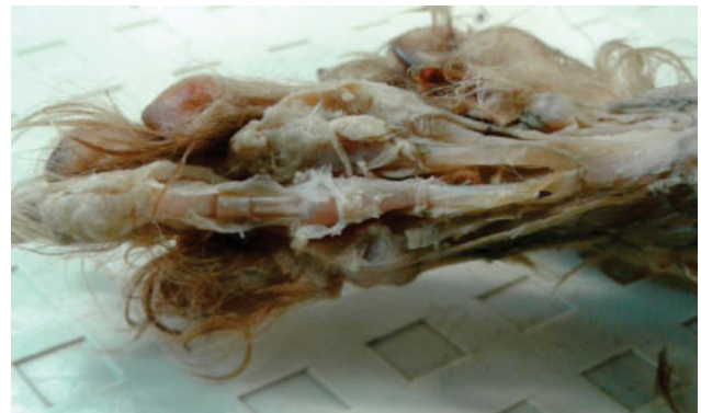
Fig. 4 Distal dog forelimb. Fine dissection of flexor tendons and of the manica flexoria in a 4 kg poodle cadaver.

Easy knee movement. Online content including video sequences viewable at: www.thieme-connect.com/products/ejournals/html/10-1055-s-0038-1669434-jms-1211-v2.mp4 .