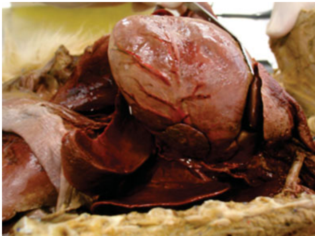
Fig. 2 Soft-preserved dog heart. Almost life-like appearance of viscera in a prosected dog cadaver injected with latex.

The process of dissection of the cadavers preserved with the new formula is much more comfortable, due to the lack of offensive odors. The skin, muscles and viscera maintained their natural appearance, with a slight hardening of the tissues. Due to the preserved flexibility of the joints, it was possible to dissect the most distal parts of the extremities, such as the flexor digitorum superficialis, the manica flexoria