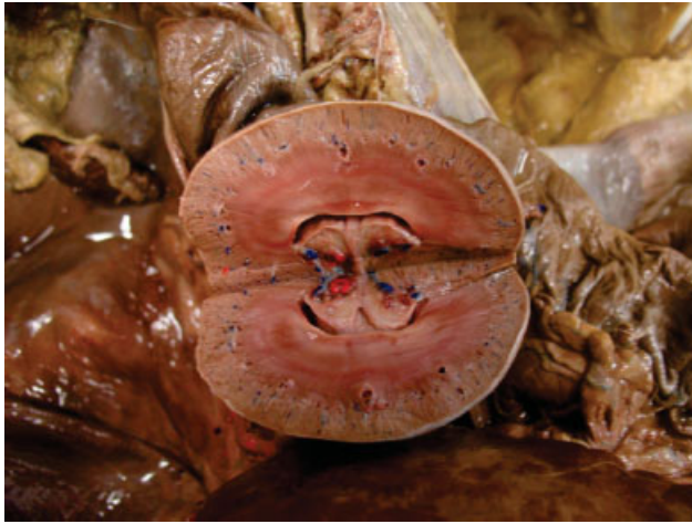
Fig. 1 Soft-preserved dog kidney. Good preservation of contrast between the medulla and the cortex of the kidney, with colored latex highlighting arteries (red) and veins (blue).

distribution of the latex dye on small arteries and veins than the second procedure, probably because the preserving solution dehydrates the cadaver and produces shrinkage of the lumen of the small vessels (► Figs. 1 and 2 ). Liquid leaked from the cadavers during the first 15 days and had a very low concentration of alcohol (0–15%), which is an indication of the dehydration process of the cadaver.