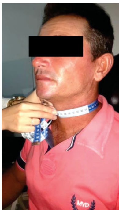
Fig. 3 Measurement of cervical circumference.

After evidencing the lack of possibility of visual access to the D'Avila's Areas, especially Area I, which corresponds to the anterior third of the vocal folds and the anterior commissure of the larynx, it was introduced the first and important