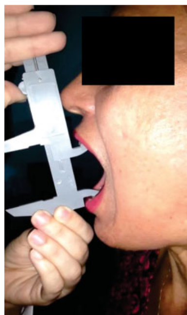
Fig. 4 Measurement of oral opening.