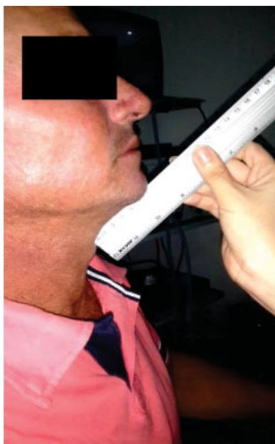
Fig. 5 Measurement of thyromental distance.