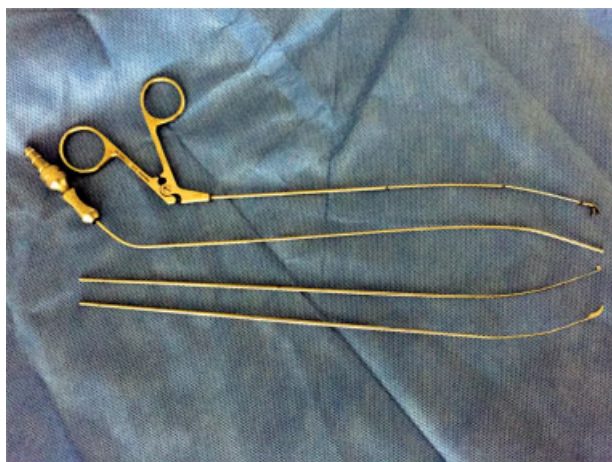
Fig. 6 Material developed for the technical variant.

Two types of variables were analyzed: categorical variables (oral opening, cervical circumference and thyromental dis-