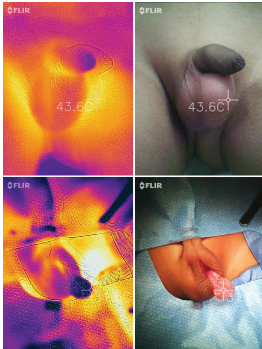
Fig. 2 Sequential images with infrared camera showing the changes in temperature throughout the scrotal exploration and testicular detorsion. (A) Image prior to prepping the patient with a temperature of 43.6°C on the left side and 41.7°C on the right hemiscrotum. (B) Immediately after the testis had been brought out through the incision, the temperature was 31.5°C. (C) Thirty seconds after detorsion, the temperature increased to 34.3°C. (D) One minute after reperfusion, the temperature remained above 36.2°C.

and reconstructs it as a digital image. Changes in tissue temperature have presented a good correlation with organ perfusion. 8,9 For that reason and based on our case results, the use of real-time thermography using infrared imaging is a promising technology that should be used in future studies to correlate them with postoperative outcomes. In the future, a better decision to more objectively preserve a testicle combined with a decompressive operation and possible medical management to reduce the harm of reactive oxygen specimens may offer a new standard of treatment for patients with testicular torsion.