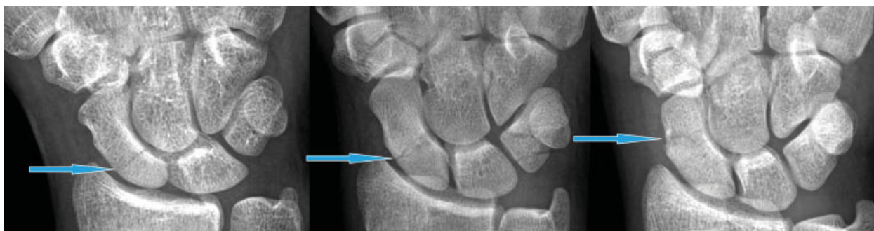
Fig. 1 Anterior-posterior radiographs showing scaphoid fractures. Fractures are indicated with an arrow. Left: scaphoid proximal pole fracture, rated as proximal pole by 89% of observers and as a waist fracture by 11%; middle: scaphoid waist fracture where most interobserver variability was seen, rated as proximal pole by 23% of observers and as waist fracture by 77%; right: scaphoid waist fracture, rated as scaphoid waist fracture by all observers.