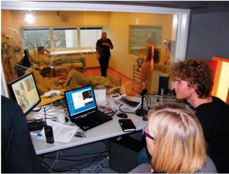
Fig. 2 Simulation room seen from the control room.