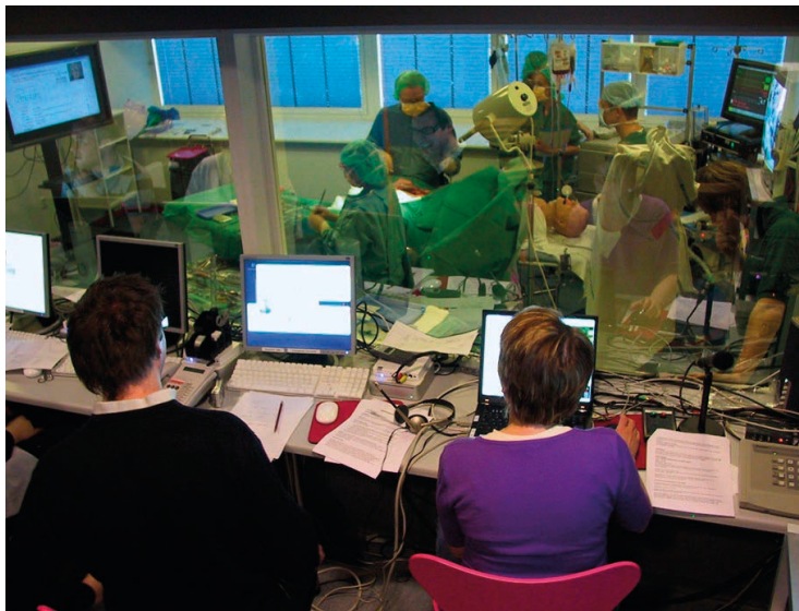
Fig. 3 Complex simulation of an operating room environment.

the simulations are completed, an evaluation is performed. Participants are asked to complete questionnaires and participate in a de-briefing interview. Observations made by the observers during the simulations are used as background for the interviews. The interview and notes from the observers are analyzed by use of Instant Data Analysis (IDA) [33]. IDA is a cost-saving analysis technique which allows usability evaluations to be conducted, analyzed and documented in less than a day. In a case study it was discovered that IDA reduced the time required to do a video data analysis by 90%. IDA also identified 85% of the critical usability problems in the evaluated system.