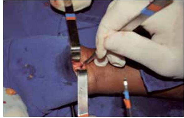
Figure 1 – Incision of the released flexor retinaculum.