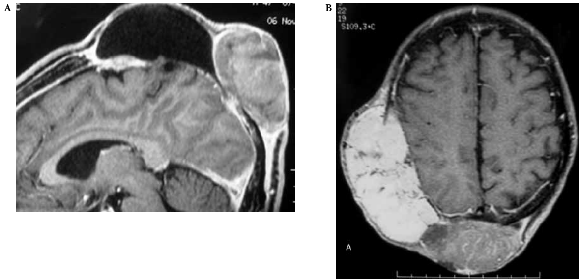
Figure 2 - (A) Sagittal view of MRI image reveals a solid-cystic lesions with apparent invasion of dural sinuses suggesting meningioma. (B) Axial view after gadolinium injection.