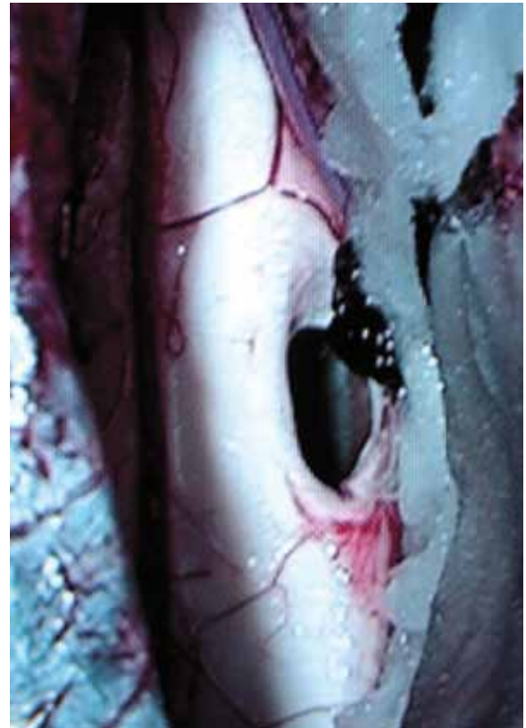
Figure 4 – Corpum callosum opened.