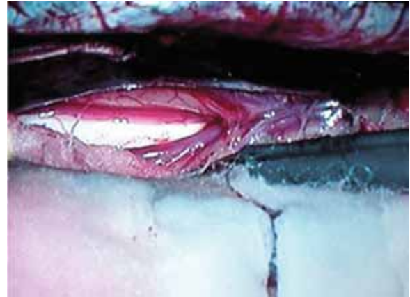
Figure 3 – Corpum callosum and pericallosal arteries.

are used to determine which ventricular space has been entered. The thalamostriate vein and foramen of Monro are used for localization. If the vein appears to the right of the foramen, then the right lateral ventricle has been entered; if it appears to the left, then the left lateral ventricle has been entered; and if no vein is visualized, then a cavum septum has been encountered.