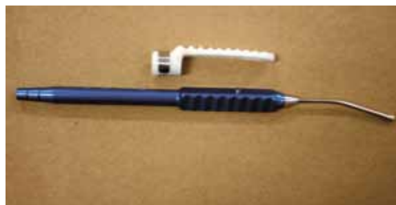
Figure 1 – Suction tube with aspiration pressure control.

The tube can be manufactured in different lengths, diameters, shapes, and angles according to the surgeon's preference and needs.