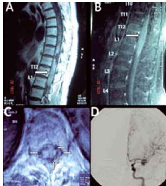
Figure 1 – Image's Studies: Thoracolumbar spine MRI (A, B, C) of spinal intradural AVFs showing an intramedullary edema (white arrow) mimicking a tumor at D11-L1 levels. (A) Sagittal T1-weighted image and (B) Sagittal FLAIR sequence show a lesion with signal hyperintensity without spinal cord contrast enhancement, making it difficult to differentiate from other entities such as intramedullary tumors. (C) Axial T2-weighted MRI shows multiple intradural vessels with flow voids in dorsal and lateral subarachnoid space (white arrows). (D) Cerebral digital angiography showing a giant aneurysm in the left MCA.

angiography and magnetic resonance. Cerebral digital angiography showed a giant aneurysm in the left middle cerebral artery (MCA) that was opted for conservative treatment according to the patient's desire (Figure 1 D). During the follow-up period (40 months) the patient has reported lower limbs improvement with muscle strength recovered to grade III. The intracranial giant aneurysm has continued no change on angiography, and the patient has not presented new neurological findings.