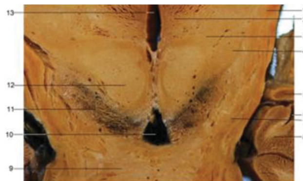
Fig. 1 Subthalamic nucleus in coronal section at the level of the red nucleus. 1-Internal capsule; 2-thalamus; 3-ventral tegmental area; 4-subthalamic nucleus; 5-Optical tract; 6-temporal horn of the lateral ventricle; 7-Cerebral peduncle; 8-Hippocampus; 9-bridge; 10-interpeduncular fossa; 11-substantia nigra; 12-red nucleus; 13-third ventricle.

In rodents, it was found that the STN consists of neurons distributed compactly and filled with a large number of blood vessels and scattered myelinated fibers. It was possible to observe the cell body of the neurons with plenty of organelles, but with only a small amount of smooth and rough endoplasmic reticulum. The nucleus is presented with a widely invaginated nuclear wrap and pale nucleoplasm with little heterocromatine. Two types of axonic terminals were identified. The first type is a small terminal with medium-sized round vesicles (possibly glutamatergic) and asymmetric synapses, mainly with thin dendrites. The second type is a large terminal with round and slightly flattened vesicles (possibly GABAergic), presenting adhesion joints with their postsynaptic targets, in addition to symmetrical synapses, mainly with bigger cell bodies and larger dendrites. 5