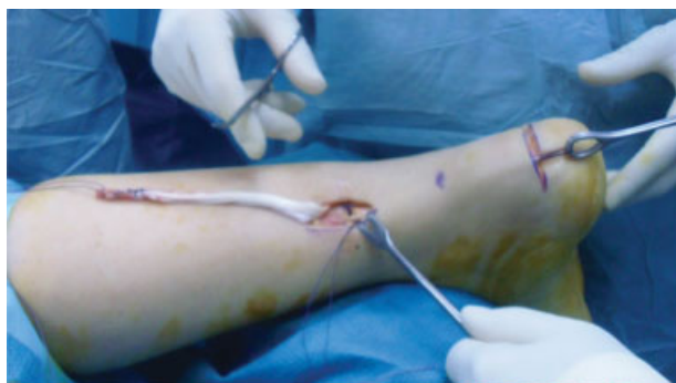
Fig. 3 The semitendinosus is passed under the skin bridge to the distal incision.

All patients were reviewed at the average follow-up of 27.9 months (range: 24–34 months) from surgery; no patient was lost to follow-up. Clinical results are reported in ► Table 1 .