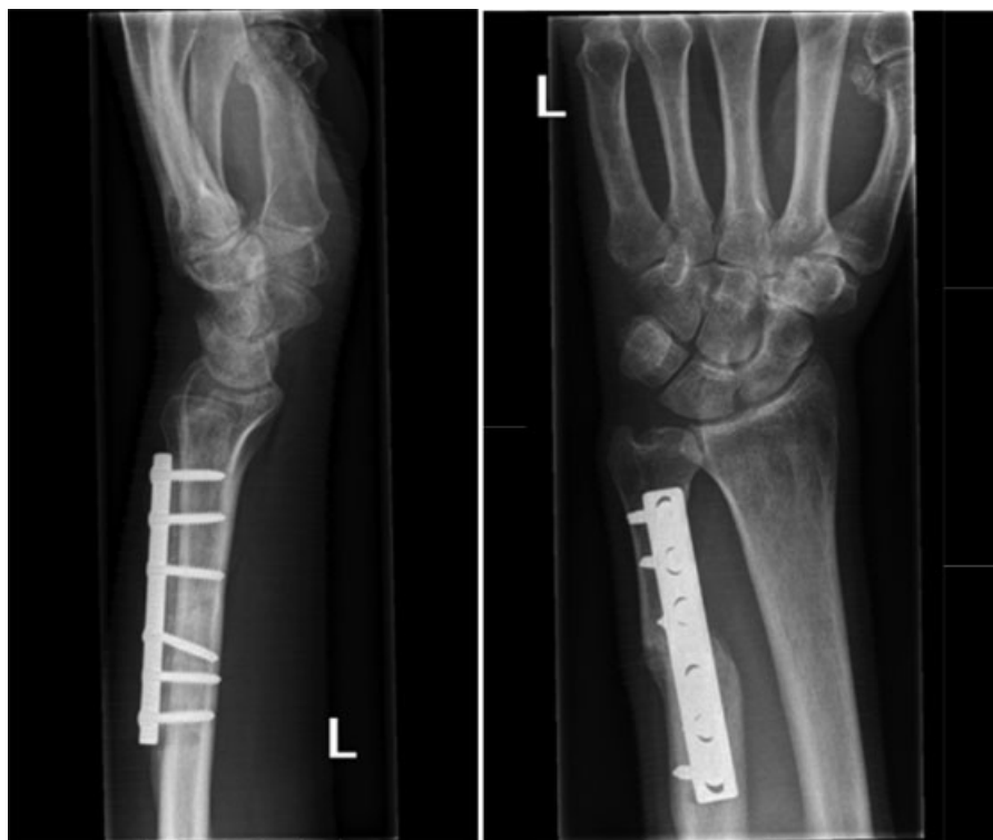
Fig. 1 Lateral and anterior-posterior views after ulnar shortening osteotomy.

All patients had been diagnosed with an ulnar impaction syndrome due to either congenital ( n = 19 ) or acquired ( n = 15 ) conditions. The symptoms included ulnocarpal tenderness, a painful ulnar stress test and positive ulnar variance on X-ray. Other potential causes of ulnar-sided wrist pain, such as arthrosis or distal radioulnar joint abnormalities had been ruled out (► Fig. 2 ).