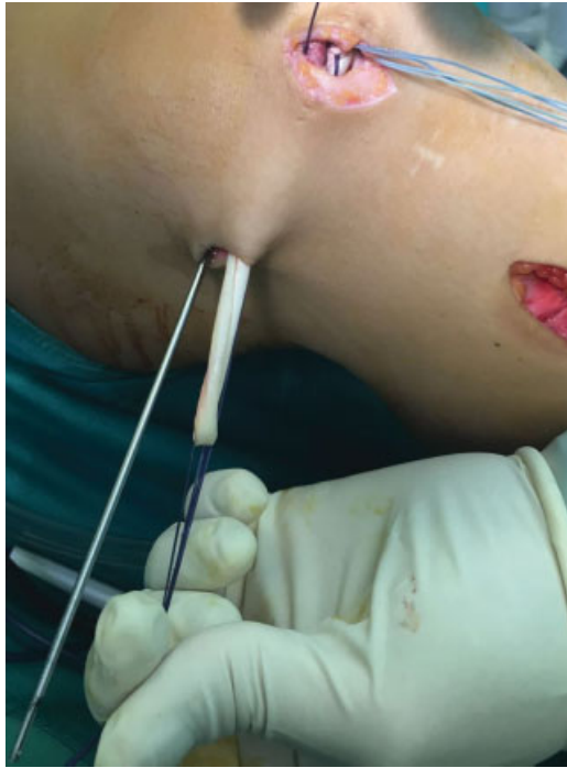
Fig. 4 The suture loop is carried by the curved clamp at the medial patellar border and used to pull the graft from the patellar side to the femoral insertion point.

an aperture fixation was assured both at the femur and at the patella. The procedure presented here represents a modification of the technique initially introduced by Schöttle et al. 6 The main difference of this procedure compared with the Schöttle's one was that semitendinosus was used instead of gracilis, since in patients with a short gracilis this tendon