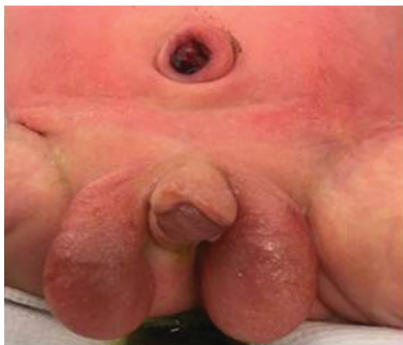
Fig. 1 Male newborn with clinical features of covered cloacal exstrophy: pubic bone diastasis, low lying umbilicus, and meconium in urine (rectourinary tract fistula).

The clinical features we present are compatible with covered cloacal exstrophy: low lying umbilicus, pubic diastasis, short colon, vesicocolonic fistula, and other urologic abnormalities. 1 Covered cloacal exstrophy is a rare disease with many different anatomic variants. The initial diagnosis of exstrophy variants