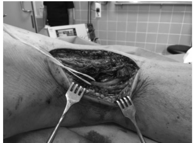
Fig. 3 After tendon repair.

but as the consequences of nonhealed injury will greatly handicap the patient we would preferably go with the treatment that is more common, therefore the operation. More studies will be required to show us what is the best therapy.