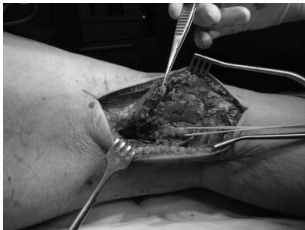
Fig. 2 The intraoperative injury.

Till now almost all patients have been treated operatively, and in the literature, we only found two cases of conservative therapy 5,8 ; therefore, it is not possible to compare it to a conservative treatment. We do know that both can work,