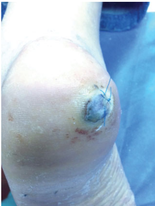
Fig. 4 Heel melanoma.

Among the four studied patients, aged between 44 and 69 (mean age: 54) years, three were females, and one was male. Three of the patients presented at least one vascular risk factor, such as diabetes, hypertension, or smoking. Three of the defects were located on the weight-bearing heel, while one was located