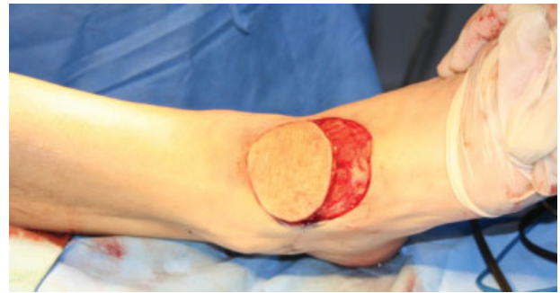
Fig. 5 Tunelized flap.

on the mid-foot dorsum (see ► Fig. 4 ). The depth of the tumor varied from a melanoma in situ to 8 mm (Breslow [► Table 1 ]). The melanomas were fully resected with appropriate margins. The sural reverse flap was indicated as the first reconstructive option for these patients. The mean size of the skin paddles was 42 cm 3 (range: 25–63 cm 3 ). All the pedicles were at least 3 cm wide. The pedicle was tunneled in one case (see ► Fig. 5 ) and in the rest of the cases it was rotated including a small strip of skin to prevent compression. Three patients were reconstructed primarily, whereas one patient was reconstructed 4 weeks after the resective surgery. The mean surgical time was 120 minutes (range: 60–150 minutes). This series revealed 100% flap survival and partial flap necrosis was not observed. Mild venous congestion was noted during the first postoperative week in all cases. Three donor defects were closed primarily and one needed a 2 × 3 cm skin graft. Two patients required a flap debulking procedure for cosmetic and functional reasons. These were performed 4 weeks after the flap transposition in both cases.