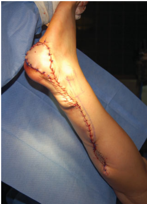
Fig. 3 The final position of the flap.