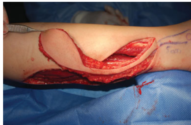
Fig. 2 Flap raising (skin covered pedicled).