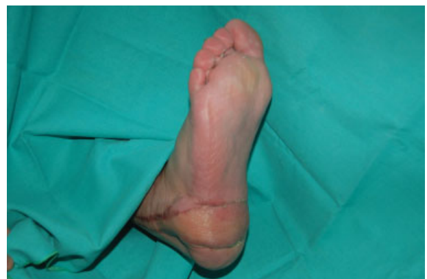
Fig. 6 Postoperative appearance after 1 month of surgery.

There were no major complications except for a mild cellulitis of the thigh perceived in patient number one who also had an inguinal lymph node dissection that required oral antibiotics. Cosmetic results were considered acceptable in all cases (see ► Fig. 6 ). After a minimal 5-year follow-up, the four patients have completely recovered the function of the affected limb, being able to practice any kind of exercise. All the patients have admitted that they experience some numbness in the area of the sural nerve dermatome. However, none of them has considered it as relevant.