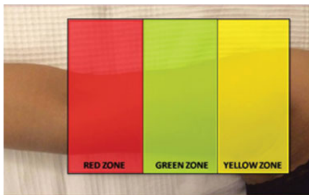
Fig. 2 The medial aspect of the arm, extending from the medial epicondyle to the axillary line is divided into three equal divisions, with the green zone being the ideal site for insertion.

In the case of dialysis catheter, the right internal jugular vein is preferred as it offers a more direct route to the right atrium (RA). If possible, subclavian vein should be avoided as there is risk of central venous stenosis that can jeopardize the formation of upper limb fistulas. 7 Femoral catheters are