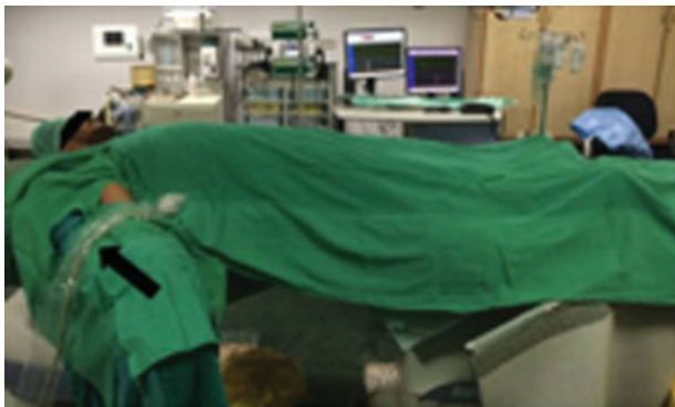
Fig. 1 The patient undergoing a PICC insertion has a full body preparation. The ultrasound probe has been covered with along probe cover.

There are a range of hemodialysis catheters in use. They are generally 14.5F dual-lumen devices with lengths varying from 19 to 28 cm and are capable of handling high flow rates (500–600 mL/min). No single catheter has been shown to be superior to the other. 7 However, the Palindrome catheter (Bard PV) that has a split and symmetric tip is reported to achieve the lowest recirculation rates among the available