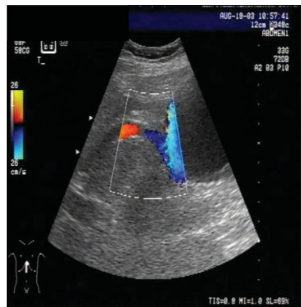
Fig. 2 In the power Doppler mode, the superficial abdominal varices are clearly visible.

approach inappropriate. As a result, a team of gastroenterologists, surgeons, and interventional radiologists met to discuss the most appropriate procedure. In the light of the patient's elevated bilirubin levels (6.9 mg/dL), and fearing the spontaneous rupture of the aneurysm, the decision was taken to lower portal pressure. The implantation of a transjugular intrahepatic portosystemic shunt (TIPS; →Fig. 3a, b) seemed to be the least invasive option. Apart from thrombocytopenia and elevated bilirubin, contraindications for TIPS implantation (hepatic encephalopathy, portal thrombosis, heart insufficiency, pulmonary hypertension, etc.) could be ruled out.