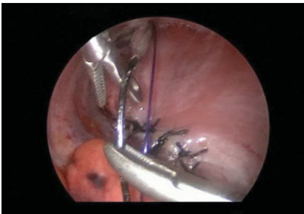
Fig. 2 To assure correct placement of the sutures and knots, a Tuohy needle was used to guide the suture around the rib and out through the same subcutaneous tract.

suturing and extracorporeal knot tying. To assure correct placement of the sutures and knots, a Tuohy needle was used to guide the suture around the rib and out through the same subcutaneous tract (→ Figs. 2 and 3). The details of this maneuver are presented in → Video 1.