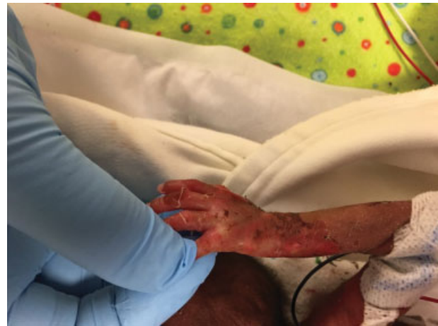
Fig. 3 Generalized erythroderma with diffuse superficial desquamation.

completed a 10-day course of nafcillin and clindamycin for appropriate coverage of MSSA. At the time of completion of antibiotic therapy, only one small area of superficial denuded skin over the extensor knee remained, which healed the following day. The remainder of her skin looked normal. The infant's general clinical condition improved and she was on baseline respiratory support.