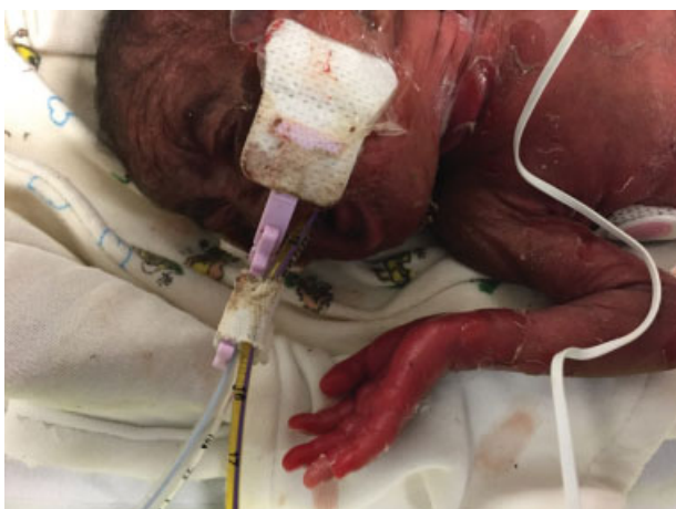
Fig. 2 Face and neck erythroderma with diffuse superficial desquamation.

desquamation, especially on her face with areas of erythema and crusted erosions around her nasal area were noted. Within the subsequent few hours, she was noted to have diffuse erythroderma and superficial desquamation of her face, hands, arms, trunk, and legs (→ Figs. 1–3 ). Clindamycin was initiated to help decrease staphylococcal toxin production. Blood cultures remained sterile but surface cultures from skin fluid, throat, and nares demonstrated methicillin-sensitive Staphylococcus aureus (MSSA). To confirm the diagnosis, sheets of desquamating skin were removed and sent for histologic examination. The examination revealed an intraepidermal split at the level of the stratum granulosum, which is characteristic of SSSS (→ Fig. 4A and 4B ). She