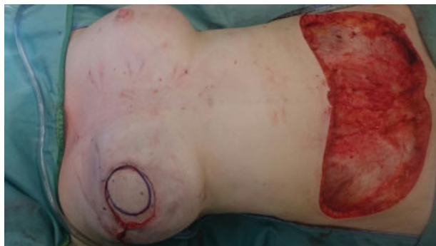
Fig. 3 Stacked superior flap as skin paddle.

The bilateral stacked SIEA flap offers the benefits of a completely autologous reconstruction. The flap harvest is more efficient than that of a deep inferior epigastric artery (DIEA) or PAP flap. There is no secondary wound and no breach in the rectus sheath/muscle reducing the risk of hernia and pain markedly. It provides an equivocal aesthetic outcome seen with other options for stacked autologous reconstruction.