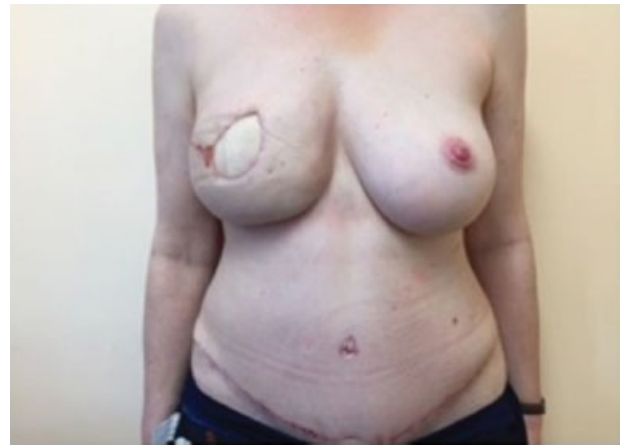
Fig. 4 Postoperative result in outpatients at 6 weeks.

There are two large series of stacked autologous breast tissue reconstructions, the first had a mean operative time of greater than 10 hours 8 and Allen et al was 7 hours and 20 minutes. 3 In our case procedure time was 7 hours and 30 minutes.