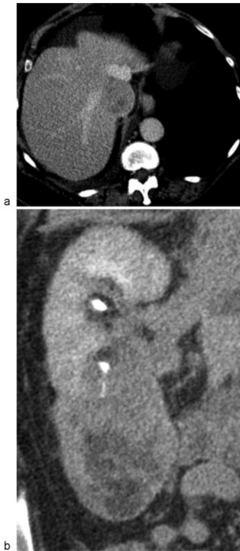
Fig. 1 (a, b) CT images demonstrating tumor thrombus within the intrahepatic IVC and right renal lower pole mass. CT, computed tomography; IVC, inferior vena cava.

artery. Obvious tumor vascularity in the lower pole was noted, extending into the right renal vein and IVC (► Fig. 2a ). Embolization was performed using 150 to 250 polyvinyl alcohol particles to stasis (► Fig. 2b ).