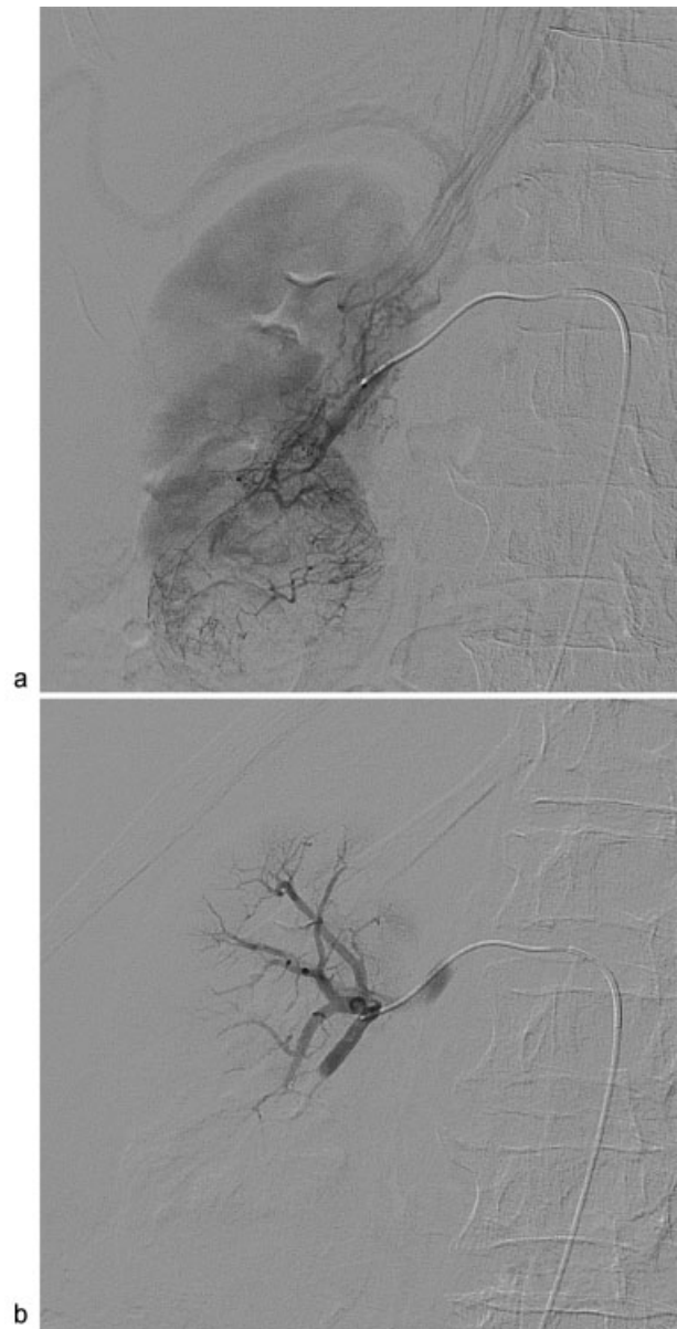
Fig. 2 (a, b) Digital subtracted angiography image demonstrating tumor vascularity within the right renal lower pole and tumor thrombus extending into the IVC (a) and postembolization DSA image demonstrating no residual tumor (b). IVC, inferior vena cava; DSA, digital subtracted angiography.

Although the acute phase of Budd–Chiari syndrome (BCS) resolved, the patient was deemed to be extremely deconditioned due to her complex medical problems, renal tumor, and thrombus burden. The patient was ultimately discharged to a skilled nursing facility with plans for palliative care.