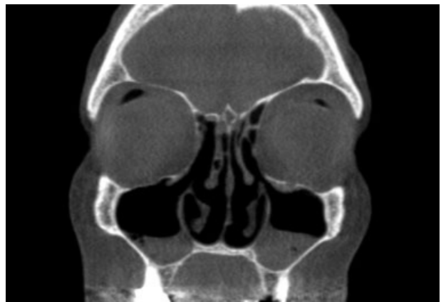
Fig. 4 Three-month postoperative sinus CT scan* frame demonstrating bilateral maxillary sinus air-fluid levels, and the postsurgical changes of the ethmoid surgery. A sinus CT scan was performed because of the maxillary sinus floor inspissated mucous found on nasal endoscopy in ► Fig. 3 . The patient's only symptom complaint was postnasal drainage and cough. Both maxillary sinuses were suctioned of inspissated mucous and sent for culture. Same appointment as ► Fig. 2 . The cultures showed no growth of bacteria. * Three hundred frame scans performed in this study using 0.09 mSev. Xoran MiniCAT™ Low Dose CT (MiniCAT™ Effective dose estimates. 5210 S. State Rd., Ann Arbor, MI 48108).

One observation found with the uncinectomy was improved visualization of and access to the ethmoid sinuses when performing a concomitant ethmoidectomy, because the uncinete process is often medialized with dilation of the infundibular space. As a theoretical problem-solving comment, if concern were to arise that formation of obstructive infundibular space synechiae could occur from mucosal trauma with the balloon device, partial or complete uncinectomy would prevent this from occurring. As aforementioned, the degree of uncinete process removal is determined by the surgeon at the time of the procedure to achieve the desired exposure.