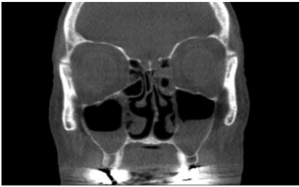
Fig. 1 Preoperative sinus CT scan b frame showing ethmoid sinus mucosal disease and bilateral maxillary sinus air-fluid levels despite multiple medical management regimens over an eight-month period by multiple physicians. This patient underwent an in-office hybrid BSD procedure with bilateral maxillary BSD with partial uncinectomy, bilateral sphenoid and frontal sinus BSD, bilateral anterior and posterior ethmoidectomies, and bilateral outfracture of the inferior turbinates. The inspissated mucous in both maxillary sinuses were removed by suctioning. Recovery was rapid, with the patient playing golf in 48 hours.

SNOT scores (between episodes), diagnosis of an ABRS can be made more objectively, instead of relying on the severity and duration of subjective symptoms. Diagnostic and treatment decision making is made easier with this procedure modification, compared with standard BSD, as these patients were significantly symptomatic even between ABRS episodes.