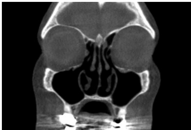
Fig. 5 Sinus CT scan* following suctioning of both maxillary sinuses. Same appointment as ► Fig. 2 . Sinus culture results showed normal flora. The patient was placed on twice daily off-label Budesonide/saline nasal irrigation therapy for 2 weeks with continued nasal saline irrigation twice daily thereafter. There was no recurrence of inspissated mucous at the 9-month follow-up appointment, with resolution of symptoms.

* Three hundred frame scans performed in this study using 0.09 mSev. Xoran MiniCAT™ Low Dose CT (MiniCAT™ Effective dose estimates. 5210 S. State Rd., Ann Arbor, MI 48108).