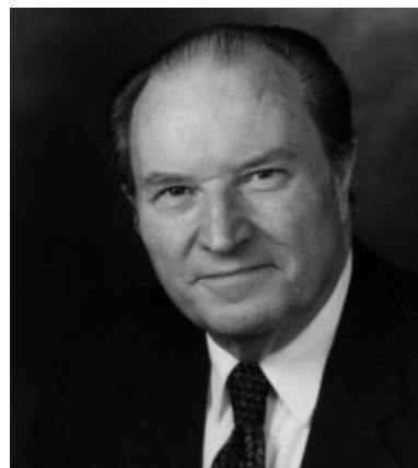
Fig. 1 Eberhard F Mammen (1930–2008).

Further details of the awards and the award winners are posted online ( http://www.thieme.com/sth ), and previous award winner announcements are also available in print. 4–14