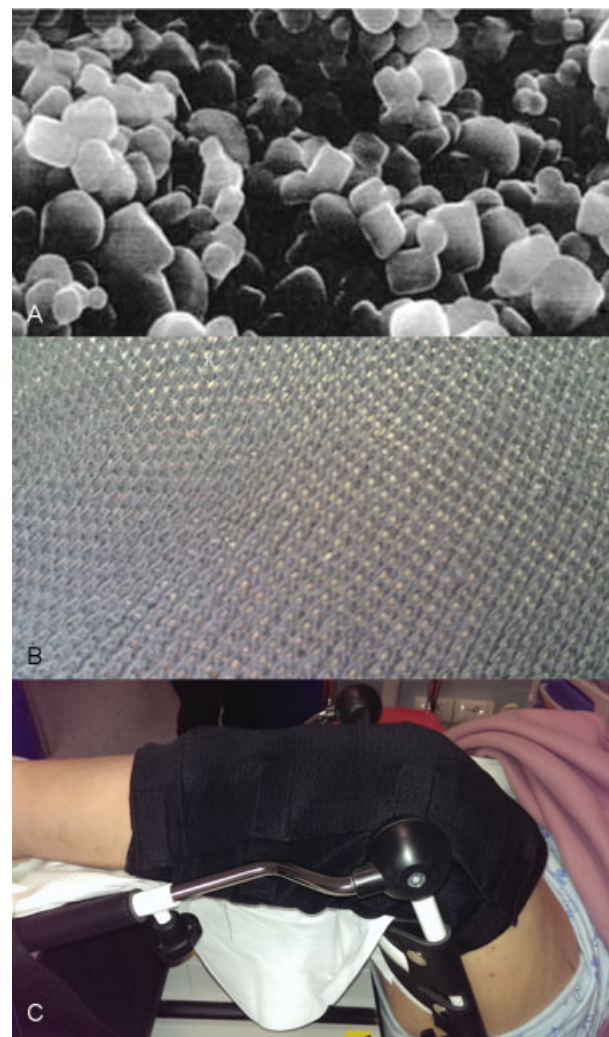
Fig. 1 Knee pad. (A) Ultrastructure at the electronic microscopy. (B) Detail of the knee pad tissue. (C) Gross appearance of the device.

A total of 27 patients at the authors' institution were selected for a single-blind, randomized study on the use of a knee pad after surgery. The study was performed at an interval of 12 months. All the patients were informed about the characteristics of the knee pad and the study, and the Institutional Review Board approved the study based on the Declaration of Helsinki. Inclusion criteria were indication for a primary TKA and possibility to attend