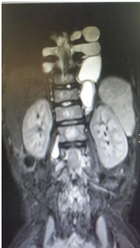
Fig. 3 Postoperative MRI of dorsolumbar spine with T2 coronal sequences done showing significant reduction in size of left-sided lateral meningocele.

improving gradually; the patient started walking with support. He had symptomatic relief from the back pain. After 1 month, a follow-up MRI of the spine revealed significant reduction in the size of lateral meningoceles (→ Fig. 3 ) and satisfactory canal decompression.