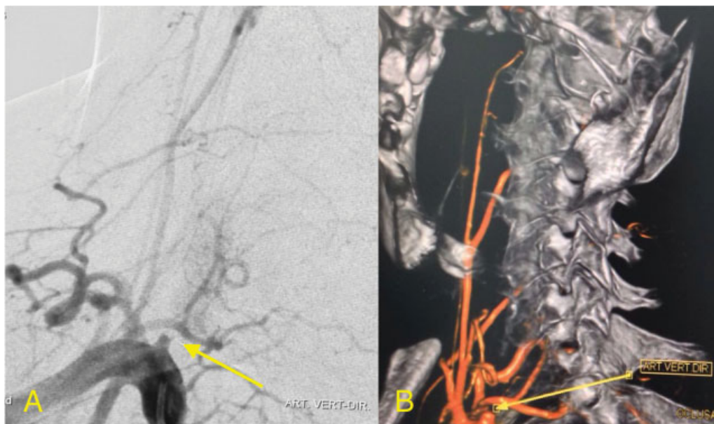
Fig. 1 (A) Initial angiography showing right vertebral artery dissection (yellow arrow). (B) Angiography reconstruction showing right vertebral artery dissection (yellow arrow).

events for a cervical pain that was extremely manipulated by this professional with strong lateral torsion.