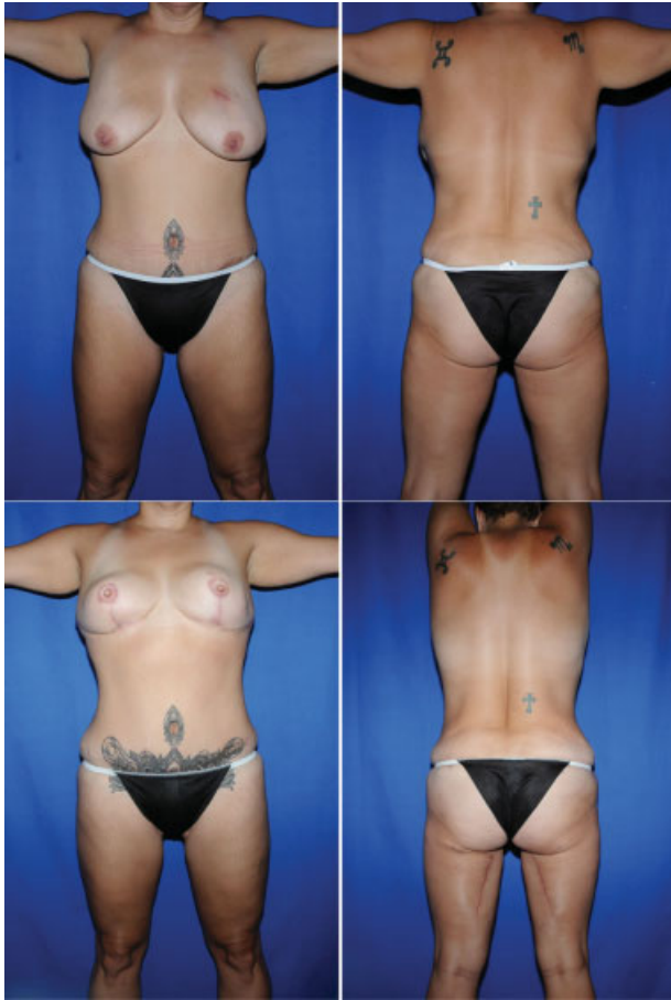
Fig. 1 Preoperative appearance of a 42-year-old female patient with unilateral multifocal ductal carcinoma in situ (upper left and right) that underwent bilateral mastectomies and immediate autologous breast reconstruction using a fleur-de-lis modification of the profunda artery perforator flap. After 6 months of the initial operation the patient underwent a second stage procedure that included bilateral fat grafting to improve contour and volume of the reconstructed breasts (lower left). No donor-site revisions were undertaken as the patient was satisfied with the postoperative appearance of her lower extremities (lower right).

posterior flap was completed using a tailor-tacking technique to avoid undue tension during the closure.