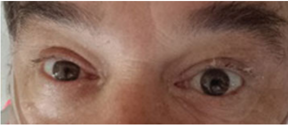
Fig. 4 Immediate postoperative photo. Right upside down ptosis and miosis.