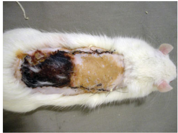
Fig. 1 The method of flap development.

The control group was pharmacologically untreated. The three test groups received 7-day courses of either: once-daily subcutaneous LMWH (enoxaparin, 4 mg/kg), starting immediately after surgery; once-daily oral clopidogrel (20 mg/kg) via physiological saline gavage (1 mL), starting 6 hours before surgery; or both agents, as described above.