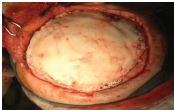
Fig. 3 Cranioplasty of a large cranial defect using PMMA prosthesis combined with a titanium mesh to confer bigger resistance.

The ceramic materials used in cranioplasty are crystalline compounds that have a structure similar to that of the bone, allowing for better osteoconduction. The most common ceramics are hydroxyapatite and carbonated calcium phosphate cement. The former is a type of calcium phosphate present as the mineral component in bone and teeth. In 1951, Ray and Ward tested the use of granular hydroxyapatite to repair cranial defects in animals. This compound is still used today, particularly in conjunction with titanium plates to