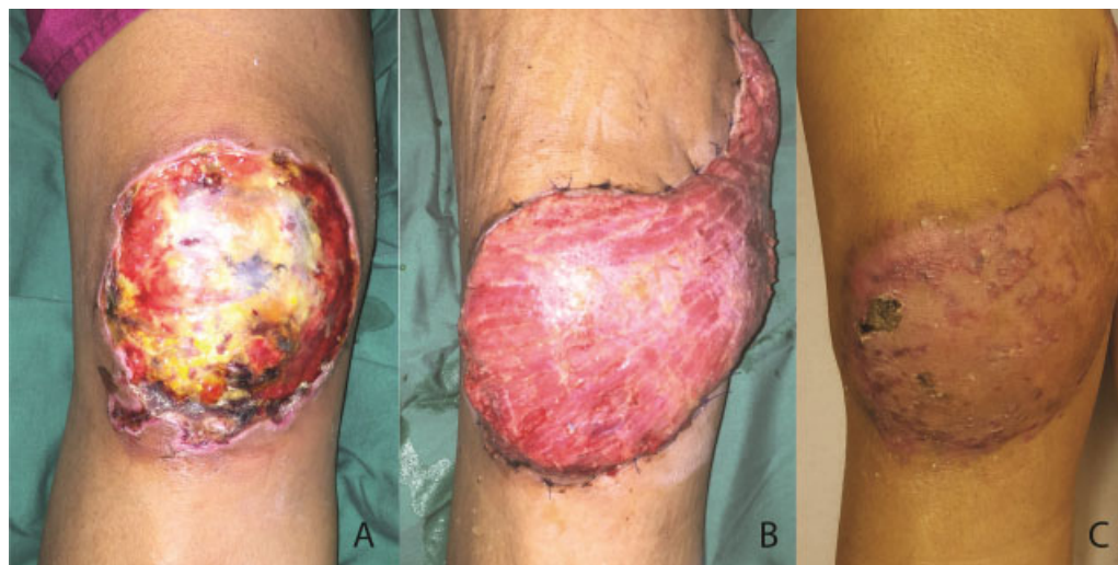
Fig. 3 (A) Preoperative photo of the wound. (B) Postoperative photo of the latissimus dorsi flap before skin grafting. (C) Follow-up photo in the clinic 2 months post operation.

been described to have a higher rate of flap failure as compared with that of other free flaps. 4 Takagi et al described supercharging of the extended latissimus dorsi flap in breast reconstruction to help reduce the rate of partial flap necrosis by supercharging the latissimus dorsi flap via an intercostal branch. Bipedicled latissimus dorsi flaps have also been described to have decreased ischemia risk. 6 Our method of using retrograde flow from the distal cut end of the genicular artery aims to improve blood flow to the flap and provides an additional safety measure or salvage method for latissimus dorsi flaps with poor blood flow.