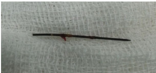
Fig. 4 Needle after removal.

scanning as the neuroradiologic modality of choice for PBI patients. The cerebral angiography is recommended in patients with PBI, where there is a high suspicion of vascular injury, if a vascular complex is crossed. It is still debatable whether craniectomy or craniotomy is the best approach in PBI patients. The goals of surgery are hemostasis, debridement to reduce intracranial pressure (ICP) and infections after closure, evacuation of a clot causing mass effect or midline shift, and repair of dura and scalp hemostasis. 7 The CSF leaks are common in PBI patients and surgical correction is recommended for those which do not close spontaneously or are refractory to CSF diversion through a ventricular or lumbar drain. The risk of posttraumatic