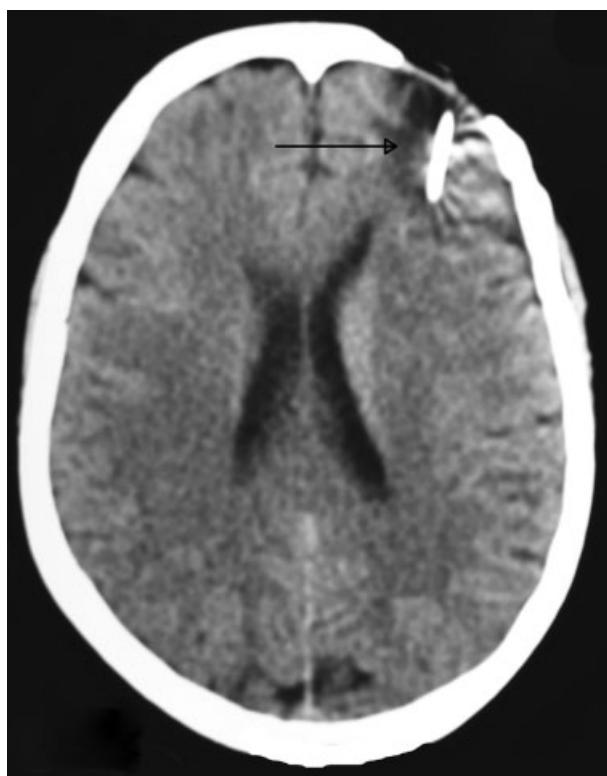
Fig. 2 Noncontrast computed tomography brain shows foreign body (needle [arrow]) in the left frontal cortex.

Postoperative neurological examination revealed no neurological deficit. Treatment with antibiotic and antidepressants drugs was continued similarly to the preoperative phase. The patient was assessed by a psychiatrist confirming the self-inflicted injury diagnosis; however, the mental status of the patient was found normal.