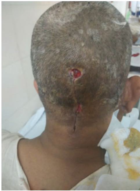
Fig. 3 Infected occipital wound.