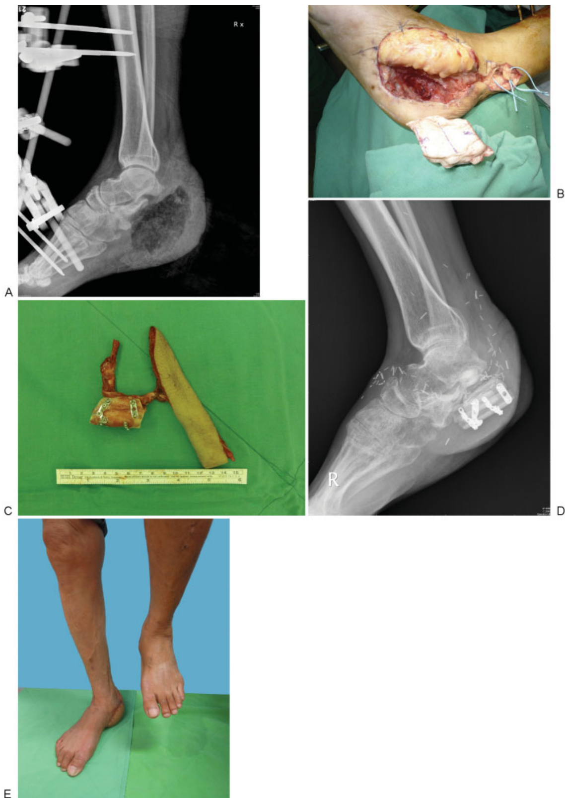
Fig. 3 (A) Case 20. A 50-year-old man presented with an open wound over the medial aspect of the right heel and open calcaneal fracture secondary to a fall from height. X-ray revealed an extensive calcaneal defect due to osteomyelitis. After serial debridement, the skin defect measured 14 \times 8 cm with total calcaneal loss. A 12 \times 6 -cm ALT flap was elevated for first-stage soft tissue coverage, and antibiotic beads were deployed to fill the bony defect. (B) The second-stage reconstruction was performed 45 days later. The calcaneal defect was preshaped with bone cement as a three-dimensional template. (C) Double-barrelled fibula osteocutaneous flap with a third barrel of free bone graft was modeled to match the size and shape of the template and inserted in situ using Kirschner wires for complete calcaneal reconstruction. (D, E) At 32 weeks, postoperative X-ray showed bony union and full-weight bearing was regained. (See ▶Video 1, which demonstrates the patient walking with normal gait.)