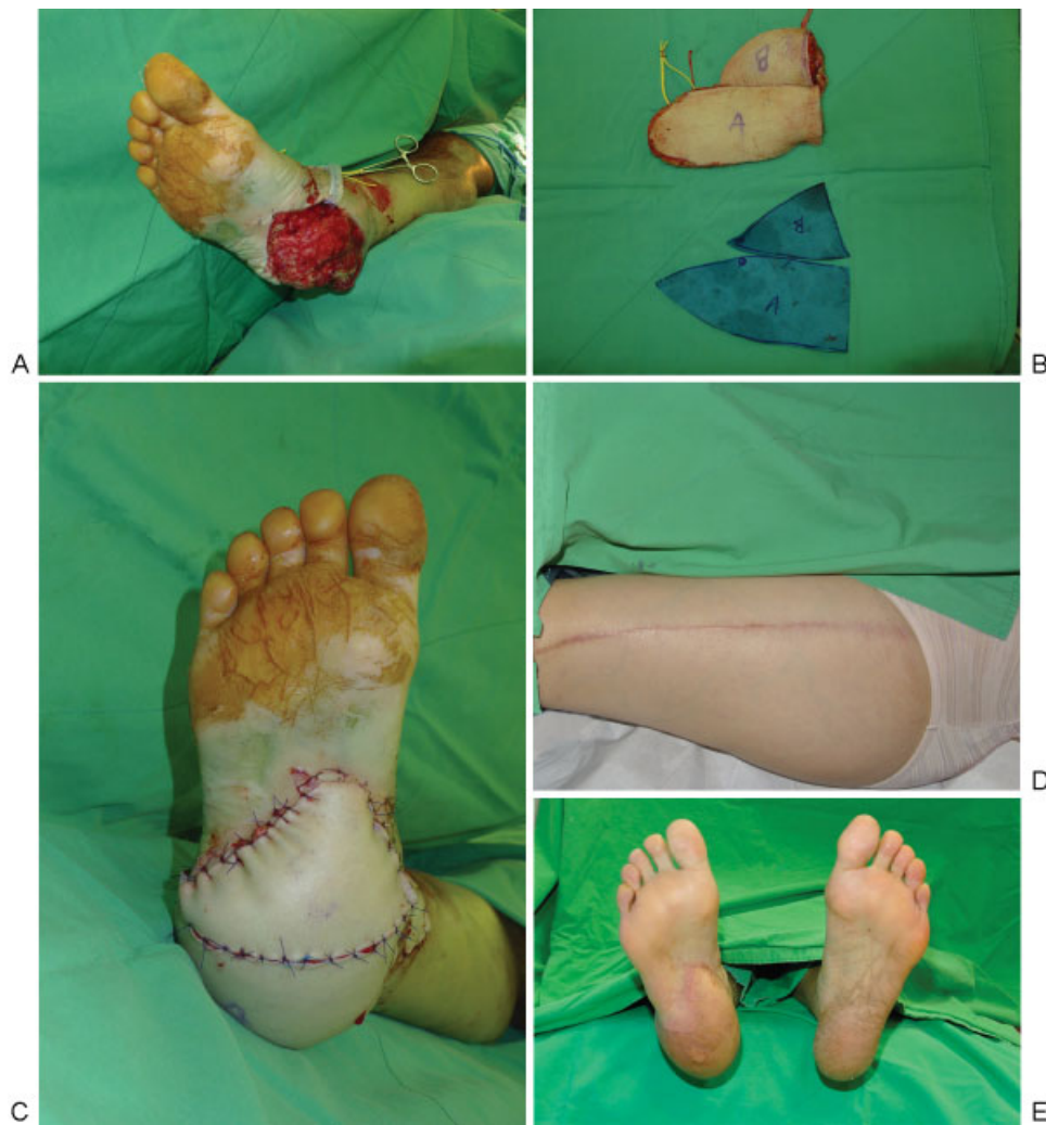
Fig. 2 (A) Case 14. A 54-year-old woman presented with right heel pad degloving injury. After debridement, the defect size measured 14 \times 16 cm and was divided into subunits A,B for a bespoke three-dimensional subunit reconstruction. (B, C) A 23 \times 8 -cm split neurotized free ALT based on two perforators was harvested. The neurotized A flap was used to reconstruct the weight-bearing heel pad, while the B flap was rotated to reconstruct the area just distal to the heel. (D) Primary closure of the donor site. (E) At 2-year follow-up, the foot demonstrated good contour, a 12-mm two-point discrimination, and recovery of protective sensation.

vascular anastomosis. The coaptation of the nerve to a sensory nerve in the foot is relatively quick and does not itself add much time to the procedure; however, meticulous reverse planning is essential to ensure that adequate nerve length has been harvested and that the skin paddle is of correct the dimensions to allow for tension-free neurotization. It is this planning process that indeed adds some time to the procedure, and the total additional operative time for neurotized versus non-neurotized flaps was on average 1 hour in our study.