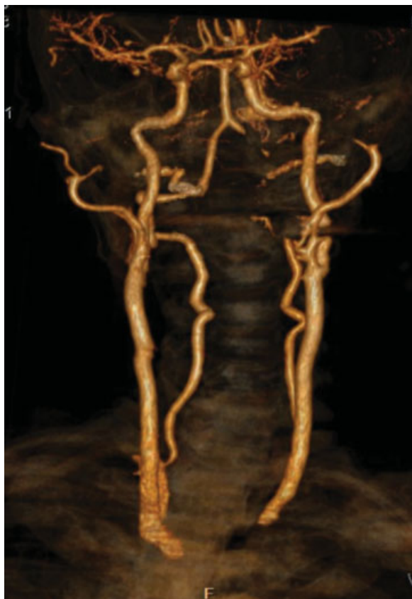
Fig. 2 Vertebral angio-CT scan revealing occlusion of the left vertebral artery.

The patient was initially maintained with a Philadelphia collar and, because of the osteoarticular lesion with disruption of the atlanto-axial joint, it was considered unstable. We then performed a cervical-occipital surgical approach to stabilize the atlanto-occipital joint.