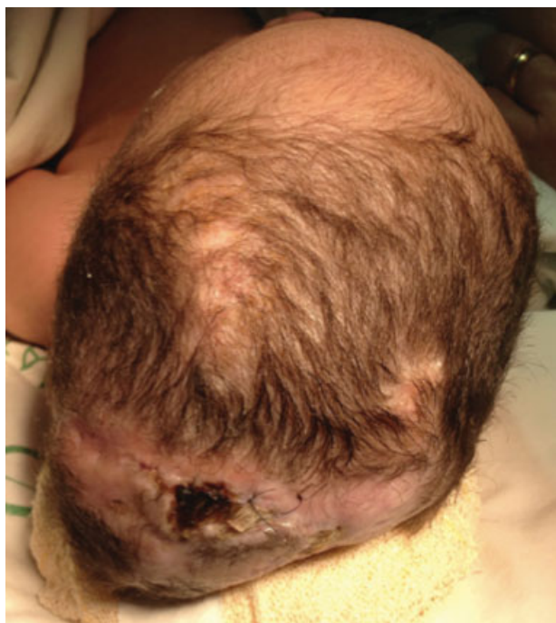
Fig. 5 Aesthetic result after closure of aplasia cutis.

sinus, should be treated surgically. 4,5,15 The size to consider for surgical treatment remains controversial. According to Ross et al, defects larger than 5 cm in diameter should be treated surgically. 16 Surgical techniques include rotation of adjacent skin flaps, pericranium flaps, and pedicle flaps (split rib grafts with a latissimus dorsi muscle flap). 1,17 The use of tissue expanders are a good option in situations in which there is little skin around the ACC, as they allow adequate cutaneous rotation. 18