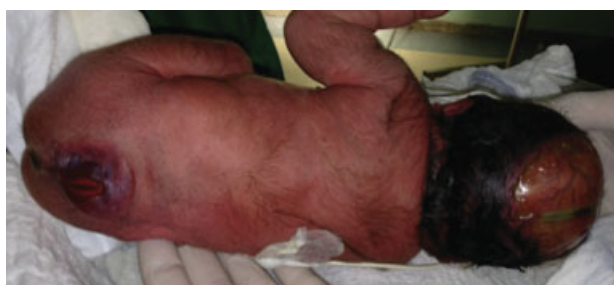
Fig. 1 Posterior view of large skull defect compatible with aplasia cutis in association with lumbar myelomeningocele.

Due to the progressive increase in head circumference, a cranial computerized tomography scan was performed at two months, revealing hydrocephaly associated with apparent obstruction of the fourth ventricular outlet (→Fig. 3). Despite the significant possibility of therapeutic failure due to age, we