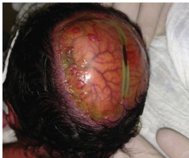
Fig. 2 Close-up view of parietal region showing the superior sagittal sinus surrounded by skin with hyperemiated margins.

treated the hydrocephaly with endoscopic third ventriculostomy (ETV). There was no suitable anatomic site to carry out trepanation on the parietal bone to place a shunt, and we sought to preserve the integrity of the skin for the use of subtissue expanders.