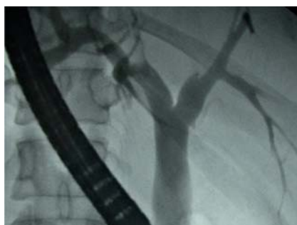
Fig. 1 ERCP film before angle measurement