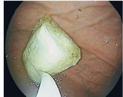
Fig. 2 Gastroduodenoscopy revealed the money bundle, which was wrapped inside a nylon bag, in the antrum.