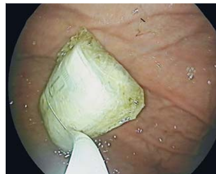
Fig. 2 Gastroduodenoscopy revealed the money bundle, which was wrapped inside a nylon bag, in the antrum.