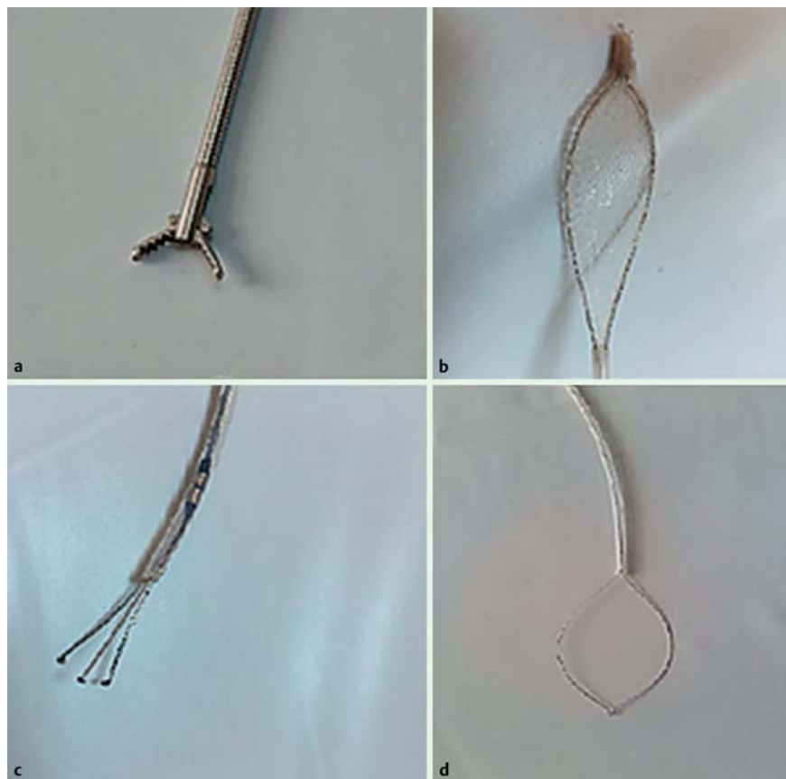
Fig. 3 Endoscopy instruments used in attempts to retrieve the money bundle. a Alligator forceps. b Retrieval net. c Tripod foreign body forceps. d Polypectomy snare.

Wars have always resulted in catastrophic consequences for the communities involved. Often, people are forced to leave their countries in search of a better life. Because the journey ahead is long and of unknown duration, people take small