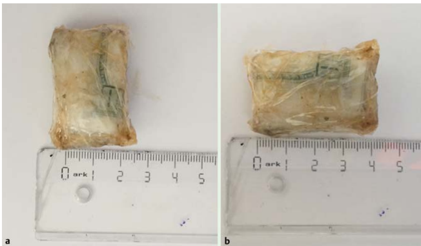
Fig. 4 The money bundle wrapped inside a nylon bag after endoscopic removal. The foreign body was 25×40 mm (a, b).

Deliberate foreign body ingestion is uncommon and the current case is a reflection of the desperation felt by the victims of war, saving what small valuables they can carry, by whatever means, even if it means risking their health. The American Society for Gastrointestinal Endoscopy guideline recommends the removal of all foreign bodies in the stomach that are bigger than 25 mm in size [1].