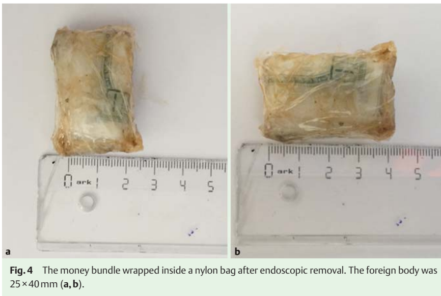
Fig. 4 The money bundle wrapped inside a nylon bag after endoscopic removal. The foreign body was 25×40 mm (a, b).

Deliberate foreign body ingestion is uncommon and the current case is a reflection of the desperation felt by the victims of war, saving what small valuables they can carry, by whatever means, even if it means risking their health. The American Society for Gastrointestinal Endoscopy guideline recommends the removal of all foreign bodies in the stomach that are bigger than 25 mm in size [1].