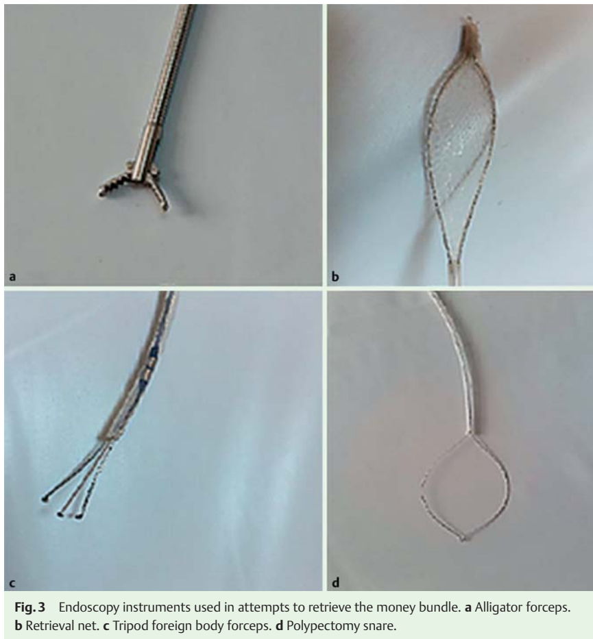
Fig. 3 Endoscopy instruments used in attempts to retrieve the money bundle. a Alligator forceps. b Retrieval net. c Tripod foreign body forceps. d Polypectomy snare.

Wars have always resulted in catastrophic consequences for the communities involved. Often, people are forced to leave their countries in search of a better life. Because the journey ahead is long and of unknown duration, people take small